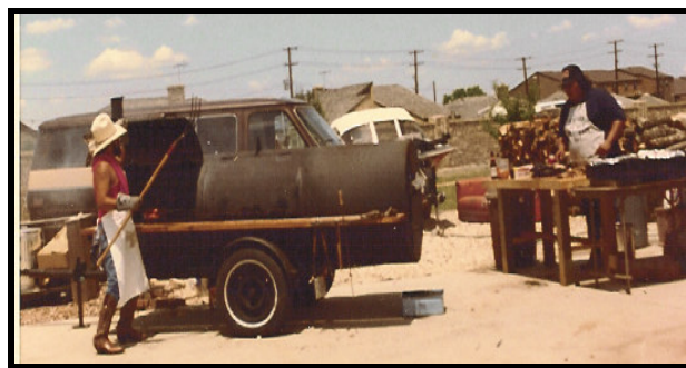
1 st COMMERCIAL BBQ CATERING JUNE 1979